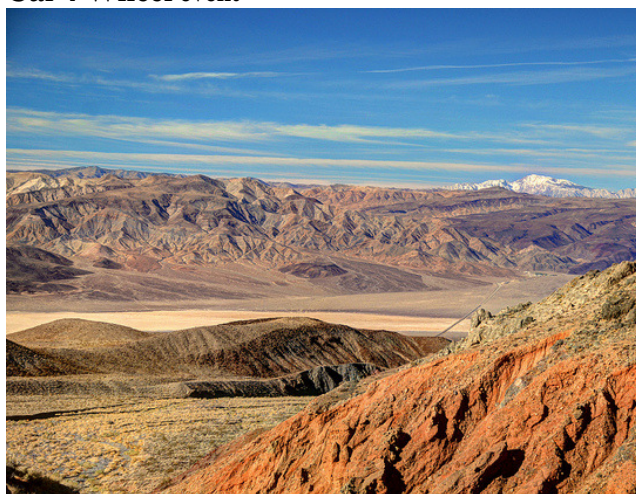
12<sup>th</sup> – 14<sup>th</sup> Panamint Valley Days (PVD), Cal 4 Wheel event

Celebrating 30 years of having fun in the Panamints with all your friends and family; all those great sunrises and sunsets. All those flyovers, the rain, the snow, and the great starfield at night, really seeing the Milky Way. All this makes Panamint Valley Days so fun and great to spend time with all your friends and family.