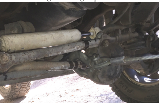
winch cable used to straighten the tie rod.