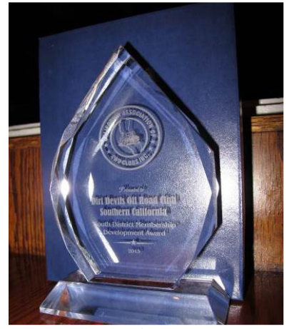
CAL 4 Wheel Drive, new member award