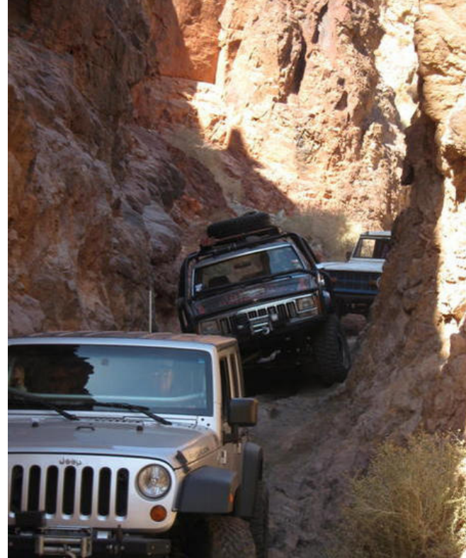
Calico December 5th read all about it on the last page